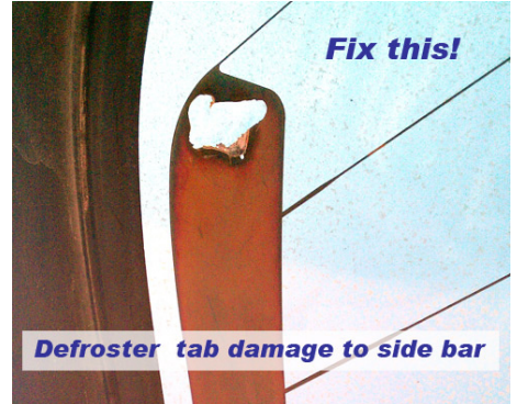
Badly damaged defroster occurred when the tab pulled some of the defroster material away from the glass.