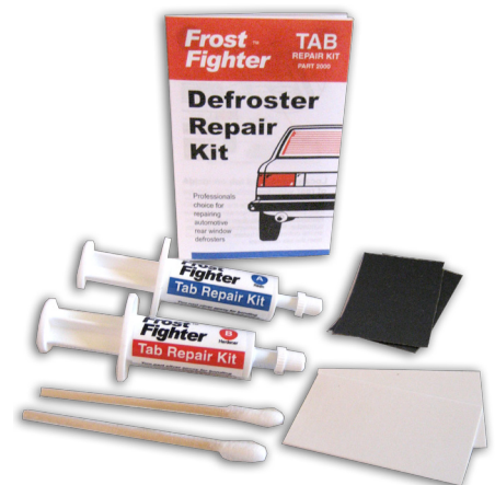
2000 Tab Bonding Kit

The adhesive's high silver loading provides maximum electrical conductivity ideal for the high amperage bonds needed in defroster tab repair.