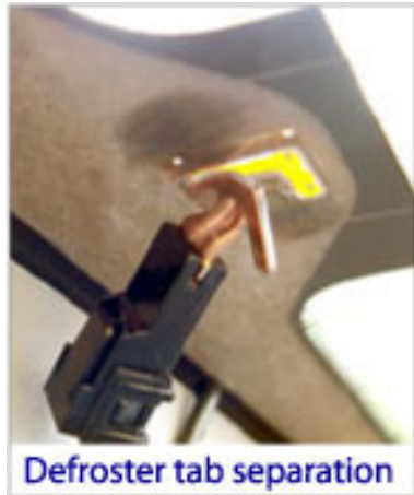
Defroster tab separation

This type of damage is especially common if multiple repair attempts