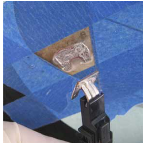
Mask off damaged area