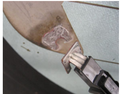
Damaged defroster pad