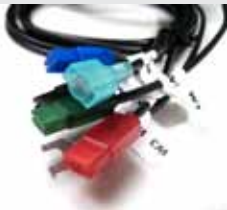
Color coded connectors

The defroster switch features an easy push button, standard defroster symbol and red indicator light. The ThermaSync control connects to the switch with 34 inch (91) flat cable. The switch can be positioned in the dash while the control can be tucked neatly away under dash.