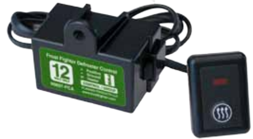
ThermaSync Timing Defroster Control and Switch