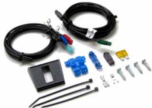
ThermaSync Installation Pack