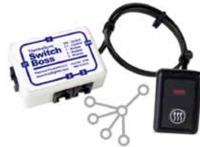
Many defrosters, one switch SwitchBoss Network control